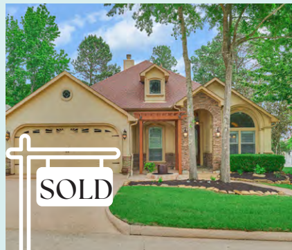
11602 Steamboat Springs