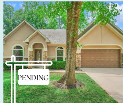
13215 Doral Circle