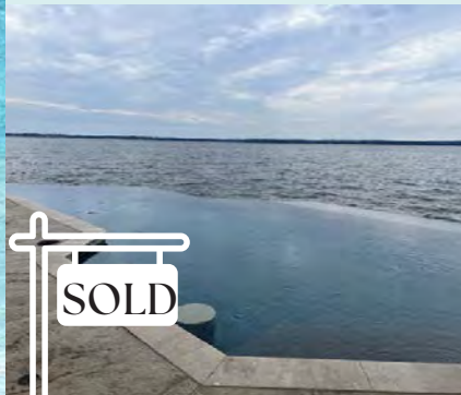
28822 Saddle Oak Dr