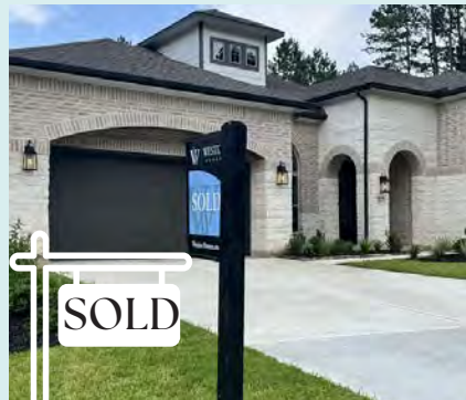
211 Ladner Ct