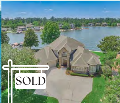
3527 Brookhaven Dr