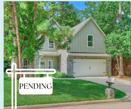
13219 Salem Circle