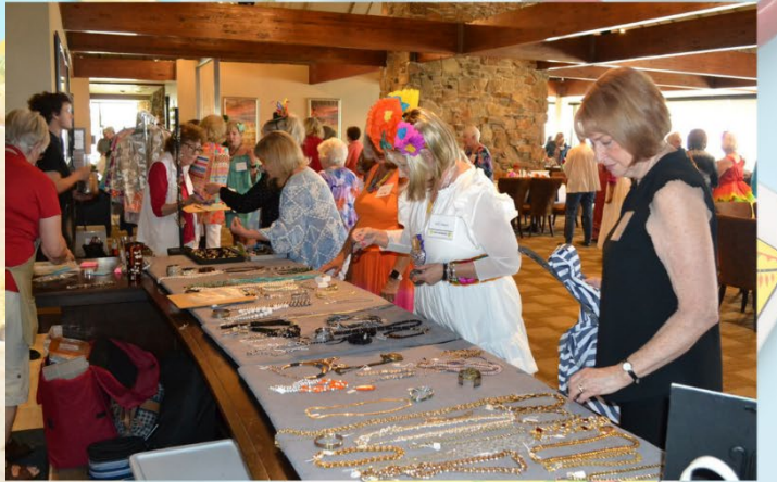
The Assistance League of Montgomery County provided a Fashion Show and Shopping Opportunities