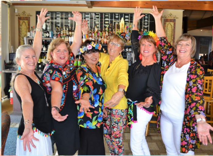
Ladies enjoying the Cinco de Mayo themed Luncheon!!!