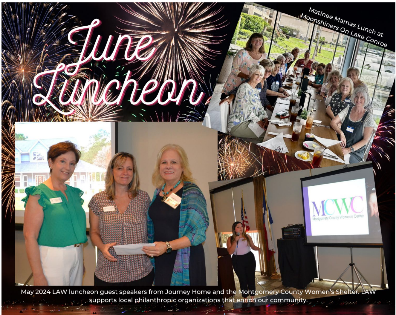
May 2024 LAW luncheon guest speakers from Journey Home and the Montgomery County Women's Shelter. LAW supports local philanthropic organizations that enrich our community.

Our theme for this new year is community enrichment. It involves assisting friends and neighbors in need, as well as supporting community events sponsored by local social, charitable, and cultural arts organizations. LAW is proud to support our local Walden Closet. If you need to borrow baby or post-surgery equipment for