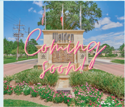
13219 Salem Circle

CALL US TODAY IF YOU'RE LOOKING TO BUY, SELL OR LEASE!