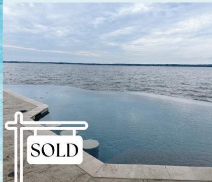
28822 Saddle Oak Dr