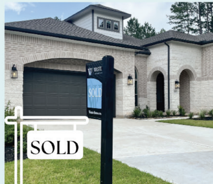
211 Ladner Ct