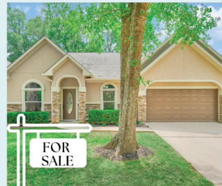
13215 Doral Circle