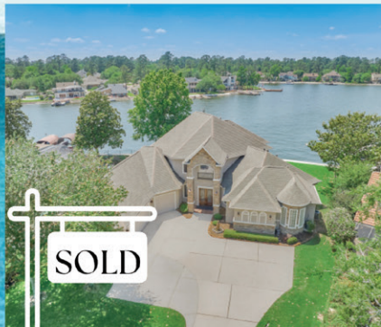
3527 Brookhaven Dr