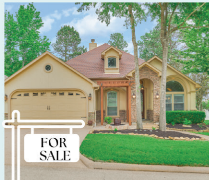
11602 Steamboat Springs